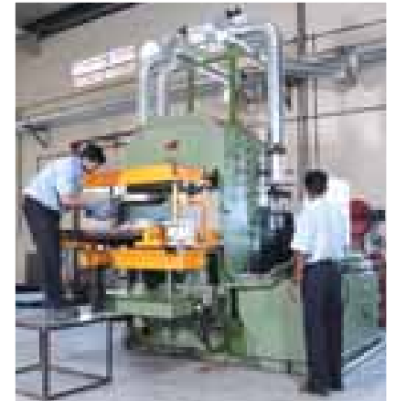
▲ Tyre Press