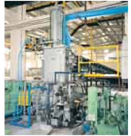
▲ Internal Mixer