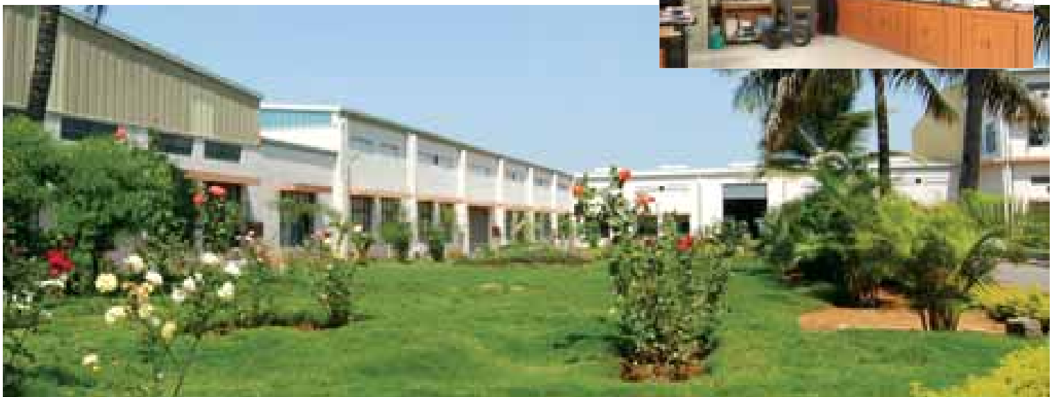
▲ Hyderabad Works